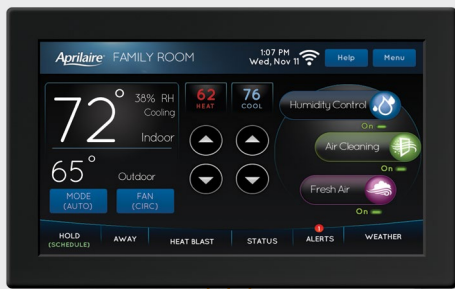
Intuitive User Interface 8920W