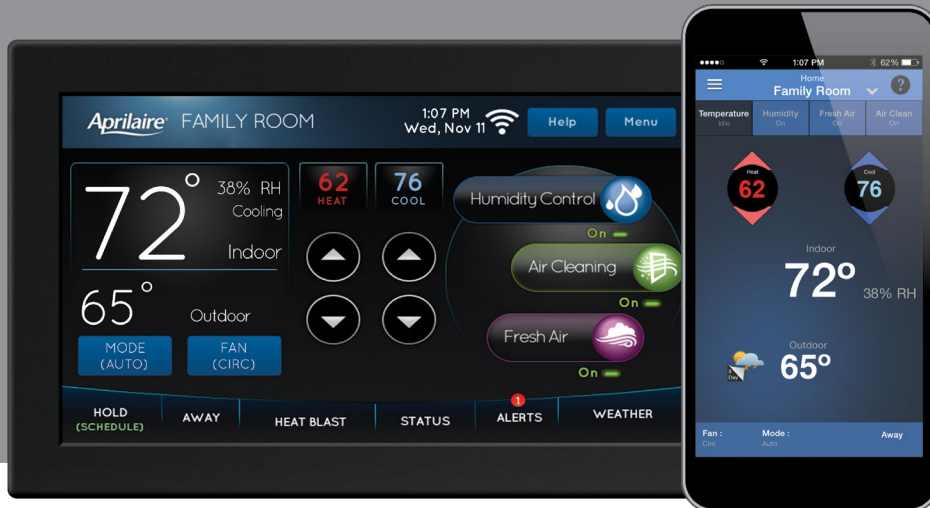
Model 8920W Shown